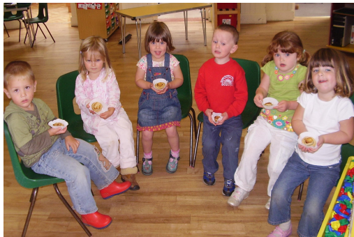
Baking our own cakes!