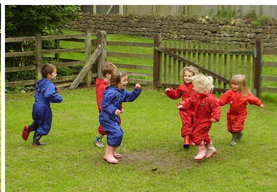
Playing in the Pre-School garden