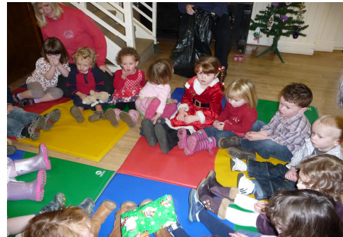
Christmas Pass the Parcel