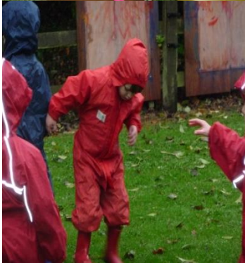
Playing in the Pre-School garden